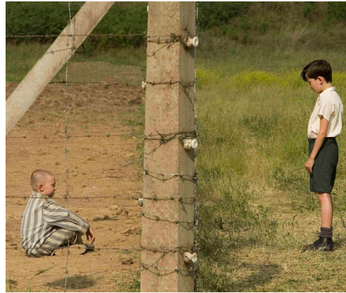
Jack Scanlon (left) as “Shmuel” & Asa Butterfield (right) as “Bruno”